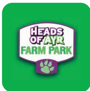
HEADS OF AYR TEAM