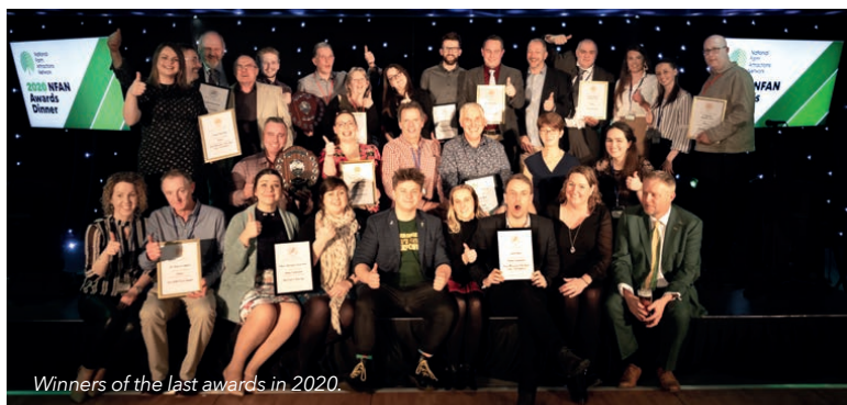
Winners of the last awards in 2020.